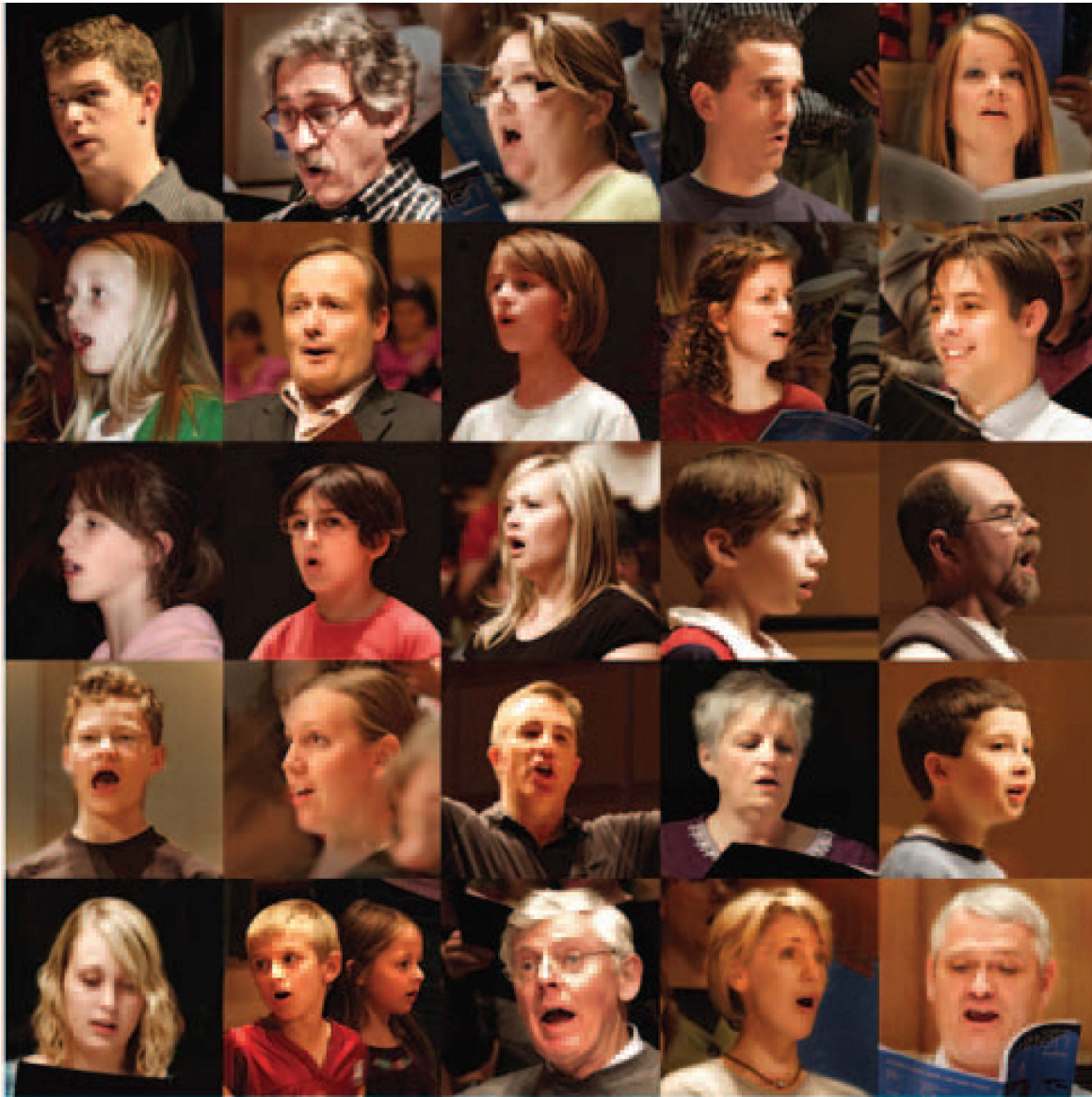
graphic design and photo manipulations > gliaeris schaefer > schaeferDesign Inc. salt lake city

Voice your support for another inspiring season.