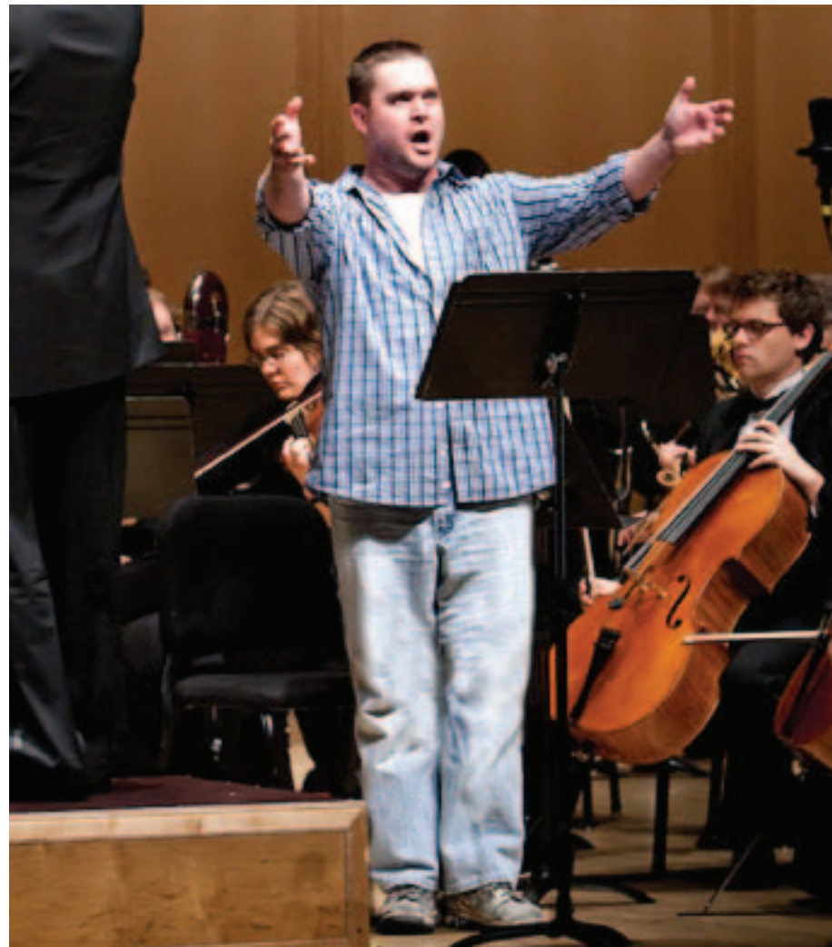
From Enemy Slayer , a Navajo Oratorio